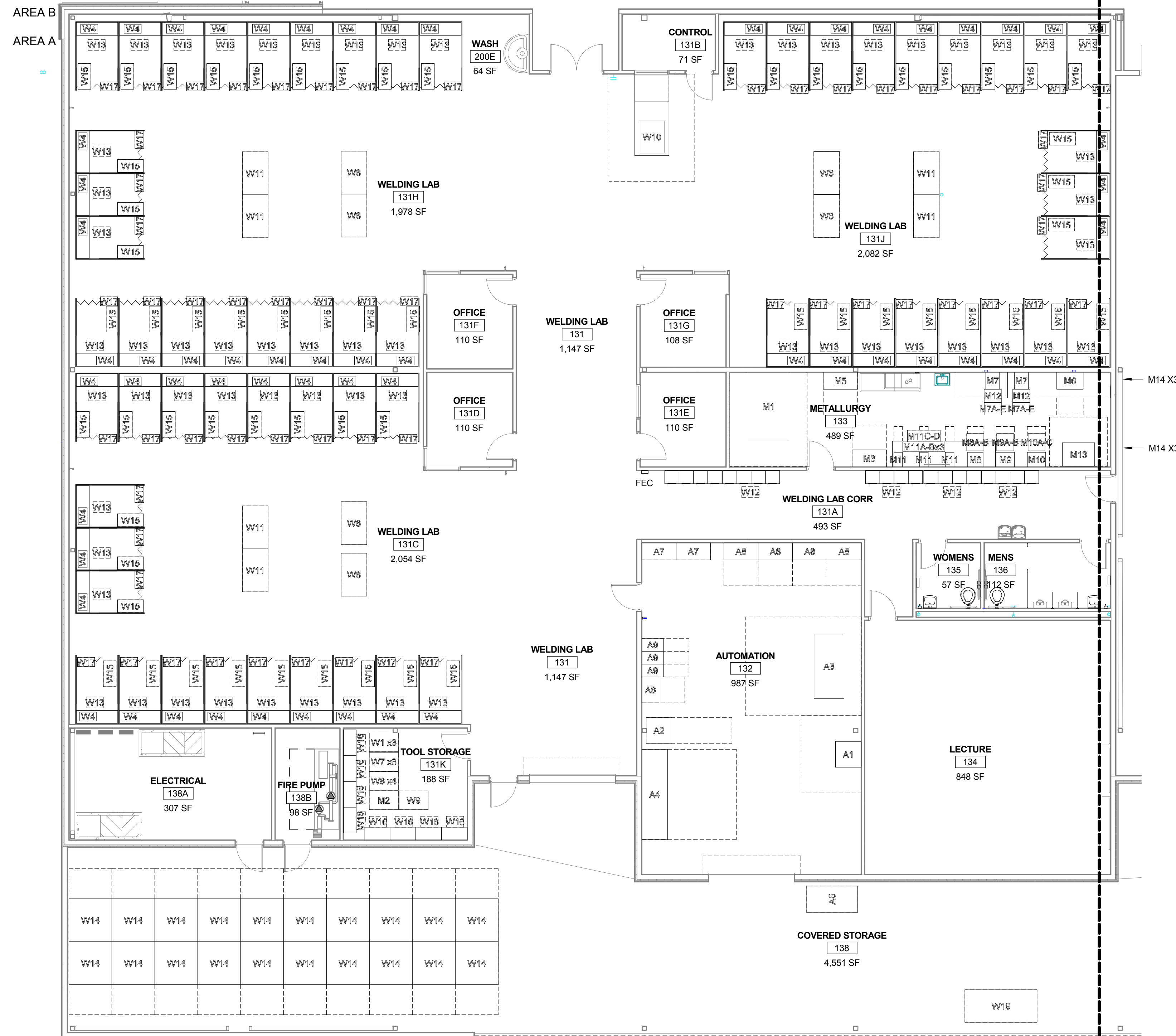
A2 EQUIPMENT PLAN 1/8" = 1'-0"